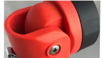
Head rotates 90° - directing beam exactly where it's needed most