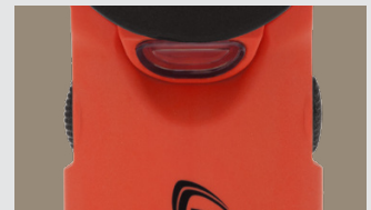
Easy-to-use with gloves, the large switches independently control separate LEDs