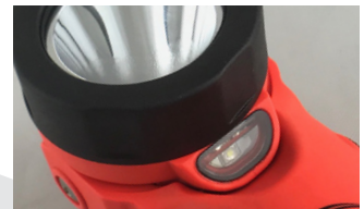
45° downward floodlight lights an 8 foot walking area