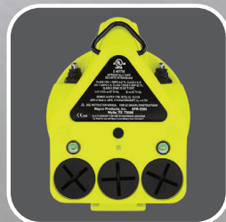
Rear-Facing Green Safety LED