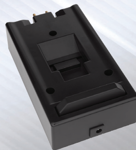
Wall or vehicle mounted charger