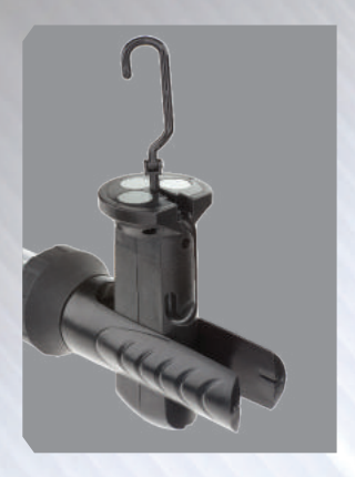
Each handle can independently rotate up or down