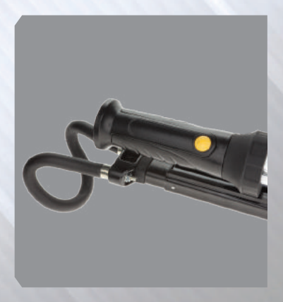
Dual on/off buttons operate in tandem on each handle