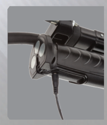
Recharges in 6 hours